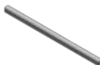
Stainless steel railing ID331