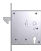
Stainless steel hooklatch ID311