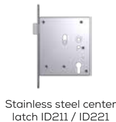
Stainless steel center latch ID211 / ID221