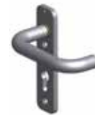
Doorhandle ID155 / ID156