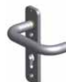
Doorhandle ID155 / ID156