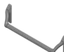
Panic opening device ID281